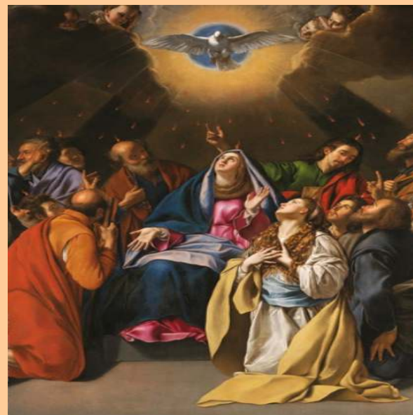
Mary, Mother of the Church Memorial - Monday After Pentecost